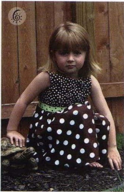
Choc-a-lot Dress by SWEET LEMONADE US$40

"Everything has g-tube pockets lined with waterproof materials to prevent stains, snaps at the neck for access if they have hep locks or a tracheotomy, and snaps in the front,"